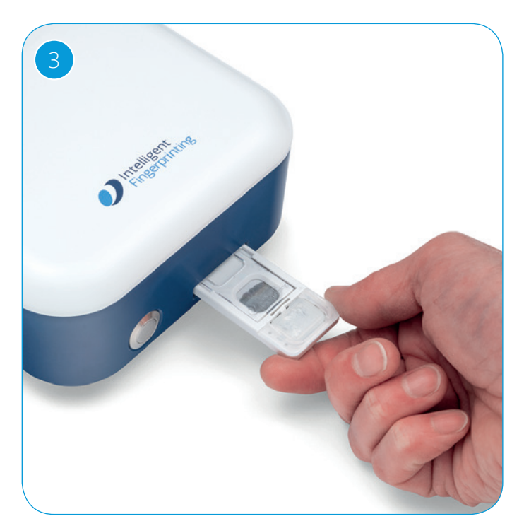
The Cartridge is placed in the Intelligent Fingerprinting DSR-Plus for analysis.