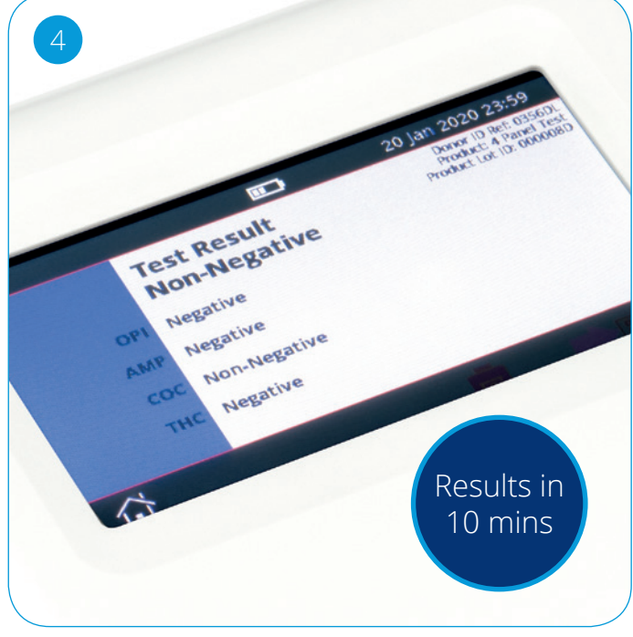
Within minutes the DSR-Plus provides a non-negative or negative result for each drug in the test.